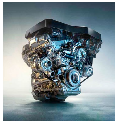
COMBUSTION-ENGINE DRIVE SYSTEMS.

Projections for 2030 EU fleet targets in all major markets are highly ambitious, and achieving them will be dependent on a number of different factors. Policy-makers will need to play a major role in shaping the environment to ensure all the necessary conditions are, and will remain, in place. This will be especially important with regard to developing charging and H 2 refuelling infrastructure to meet customers' needs, as well as for ensuring sufficient availability of renewable energy. Currently, there is a direct correlation between infrastructure density and market shares of electric vehicles. In large parts of Europe, particularly in the south and east, there is currently an insufficient density. In other parts of the world, such as the US and China, there are also widely differing framework conditions.