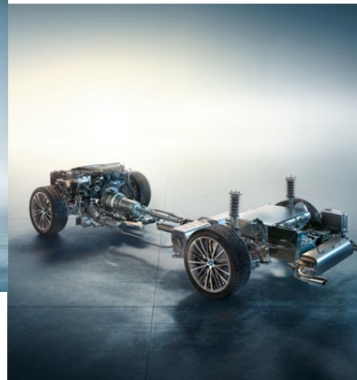
PLUG-IN HYBRID DRIVE SYSTEMS