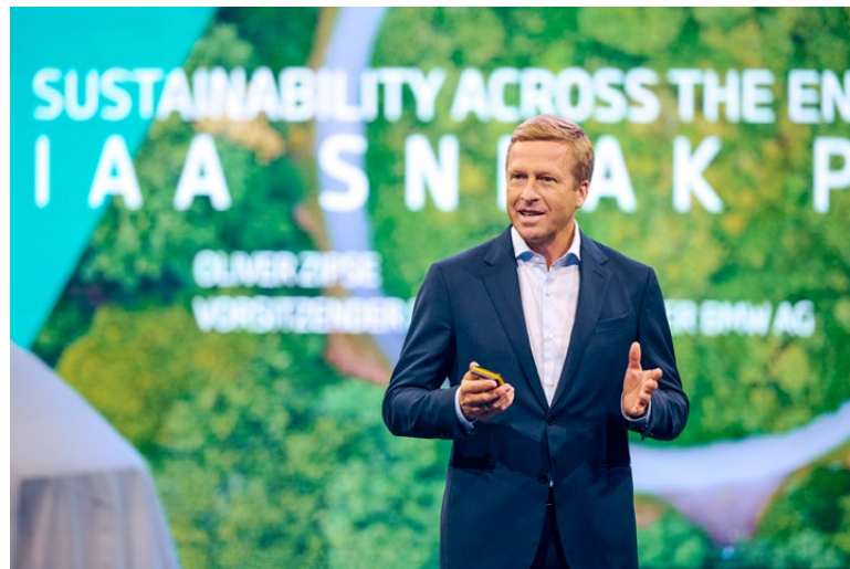
Photo: Oliver Zipse, Chairman of the Board of Management of BMW AG, at the presentation of the company's intensified climate targets in the run-up to IAA Mobility 2021.

The BMW Group – in line with ACEA – shares the 2030 ambition of the EU Commission provided that the necessary framework conditions – especially with regard to the infrastructure for electric charging points and hydrogen refuelling stations – are put in place. The targets for 2035 are to be set as part of a comprehensive revision in 2028. Since it is currently not foreseeable that the necessary preconditions can be established with the required speed, from a macroeconomic perspective, the