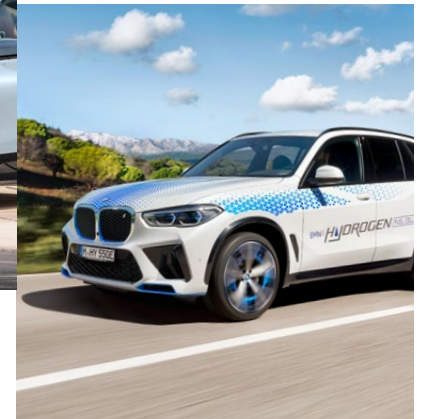
FUEL-CELL ELECTRIC DRIVE SYSTEMS

ALL DRIVES CAN MAKE A CONTRIBUTION TO CO 2 REDUCTION - THE SHARE OF FULLY ELECTRIC VEHICLES IS GROWING RAPIDLY.