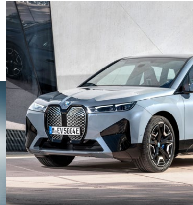
BATTERY-ELECTRIC DRIVE SYSTEMS